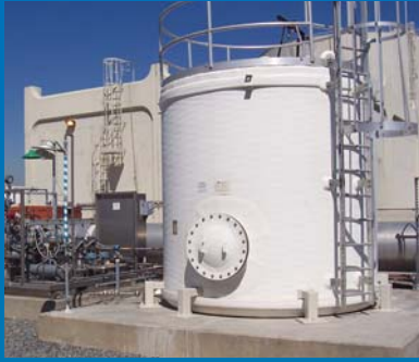
Urea solution storage tank